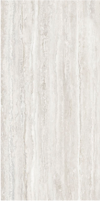
BIANCO 30 x 60 cm (12" x 24") Matte Finish KJ.TR.BIA.1224