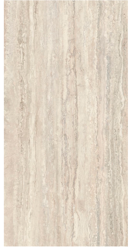
CREMA 30 x 60 cm (12" x 24") Matte Finish KJ.TR.CRM.1224

All items shown in this document are part of Olympia's stocking program. For special orders, please contact your Olympia Tile Sales Representative.