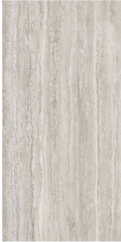
ARGENTO 30 x 60 cm (12" x 24") Matte Finish KJ.TR.ARG.1224